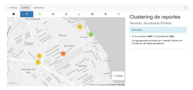
Figure 2: Clustering of reports associated with the public lighting system.

In the same way as for the heatmap representations, the cluster-based maps allow to visualize clusters generated over the entire set of services, or to select a specific service. The tool also allows to visualize clusters of reports at different granularity levels. These granularities depend on different parameter values associated with the DBSCAN algorithm, such as the distance to compute a neighborhood and the number of points required for a region to be considered dense. Clusters are color-coded to indicate if they include a large (red), medium (yellow) or small (green) number of points. CitymisVis uses the implementation of the DBSCAN algorithm available through the ELKI environment [10] while the Mapbox tool is used to display the generated clusters on the corresponding map. Figure 2 shows different clusters obtained for the analyzed dataset, with colors representing different concentrations of reports.