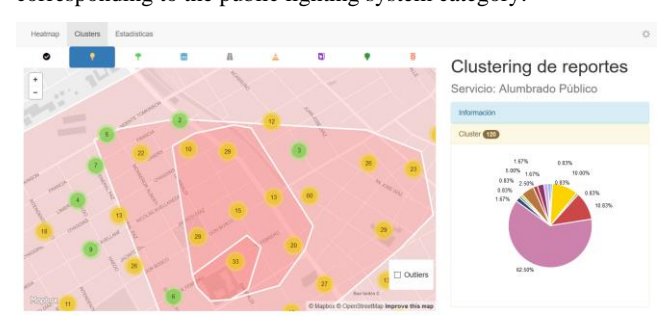
Figure 3: Hierarchical greedy clustering of reports (left) and pie chart for subcategories of the public lighting system (right)

radius. These points are used to form a new cluster. A new point that is not part of the existing clusters is selected in a greedy manner and the steps are then repeated until all points in the dataset are considered. The DBSCAN algorithm is used to identify the main clusters, and then combined with the hierarchical greedy clustering method offered by Mapbox to dynamically and efficiently identify sub-clusters at different granularity levels. This results in a set of nested polygons associated with the cluster selected by the user and its sub-clusters. The left-hand side of Figure 3 shows the polygons resulting from applying hierarchical greedy clustering to the reports associated with the public lighting system service of the San Isidro municipality. On the right-hand side of Figure 3, there is a pie chart showing the proportions of reports belonging to different subcategories of the service under analysis. For instance, the public lighting system service category includes 16 subcategories, such as streetlight off, blinking streetlight, new light request, streetlight repair request, etc. Hovering the mouse over individual slices of the pie chart allows to identify the corresponding subcategory. In the presented example, the streetlight off subcategory (light blue) is the most common one, accounting for 61.98% of the reports corresponding to the public lighting system category.