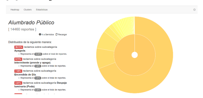
Figure 6: Sunburst resulting from zooming in on the public lighting system category.

Categories and subcategories in the sunburst can be identified by hovering the mouse over them. A special feature of these sunbursts is that they are "zoomable". In other words, they offer the possibility of clicking on a slice at any level to produce a new sunburst for the selected category or subcategory. Figure 6 illustrates this feature by presenting the statistical information and the sunburst corresponding to the public lighting system category. The zoomable sunburst with updating data implemented with d3 [12] is used to generate these charts.