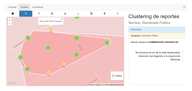
Figure 4: Information associated with a report within a cluster.

If needed, the user can inspect an individual report by clicking on the marker representing the report. This gives access to additional information of the report, including its location and the comment submitted by the user. This functionality is illustrated in Figure 4.