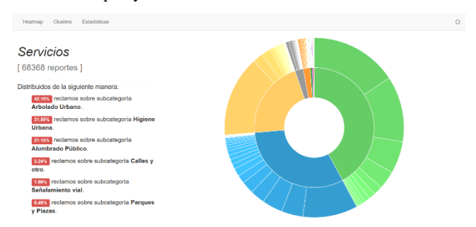
Figure 5: Sunburst chart for the reports associated with all the service categories and subcategories.

root node of the tree is at the center while the leaves lay on the circumference. The area of each slice corresponds to its value. Figure 5 presents a sunburst summarizing the proportions of reports related to all the service categories and subcategories in the San Isidro municipality.